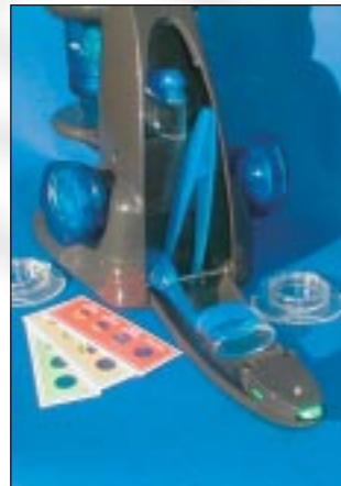
There is a concealed storage chamber built into the stand.