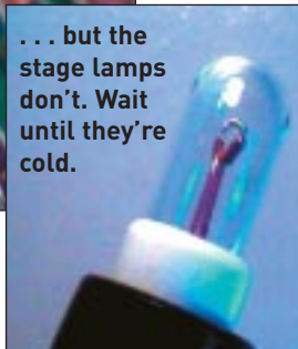
... but the stage lamps don't. Wait until they're cold.