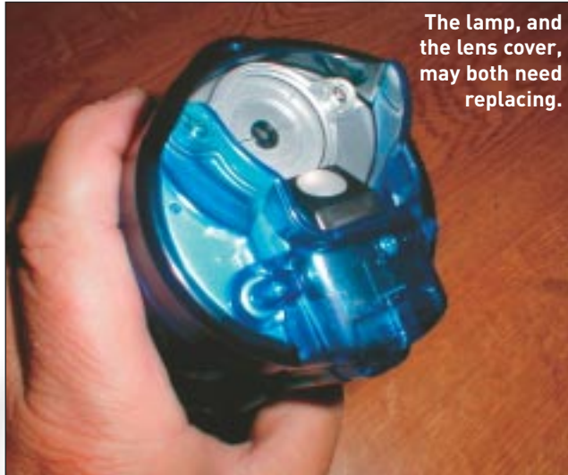
The lamp, and the lens cover, may both need replacing.

mine's still OK. Keep the microscope dry at all times, and wipe it with a clean cloth if necessary. Never use cleaners or polishes. You might add forceps, a pipette or two, and some collecting tubes (with stoppers) to your accessories. There is a protective clear filter over the lenses, which may need replacing if it becomes scratched. The quartz lamps burn out in time, too. When changing a bulb, never touch the quartz with your fingers, because that can contaminate the quartz and damage the bulb. Replacement bulbs and other spare parts are available from the manufacturers via their web site.